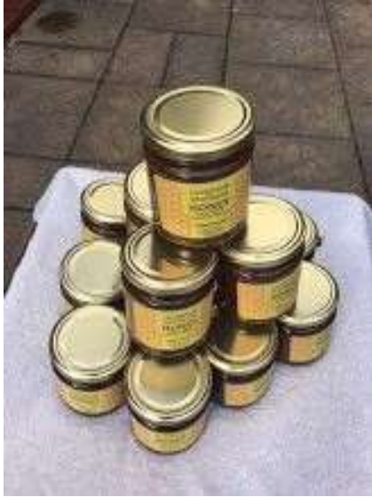
Our very own honey.

This month we have been meeting with new or prospective beekeepers in the Llangattock school room on Wednesday evenings, learning about the beekeeping year and other subjects relating to the skills required for honeybee husbandry. Although many more expressed an interest in joining, the weather and other previously booked engagements have meant that all those who booked a place have been