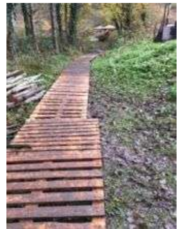
Pallet bridge to keep our feet dry

We have all seen the floods across the country and Llangattock didn't miss the rain at the end of October with the Usk flooding again and causing chaos. The Alder Carr is special because of the water which runs through the site but sometimes it comes up in unexpected places. There is a spring which flows underground across the meadow and most of the year will emerge somewhere in the woodland. After heavy rain it rises much sooner flooding the main pathway from our work area to the hub of the woodlands. Last week we decided there was only one thing for it, a 'pallet bridge'! The long term aim will be to provide a French Drain system which has helped elsewhere on the site but it needs a mini digger and much more thought before we can do that. In the meantime the pallets are providing exactly what we need to keep our feet dry.